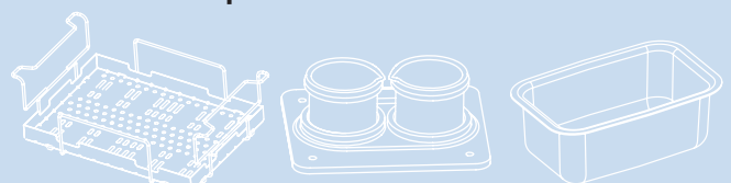
Stainless Steel Rack & Tray