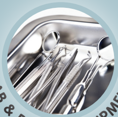
LAB & DENTAL EQUIPMENT